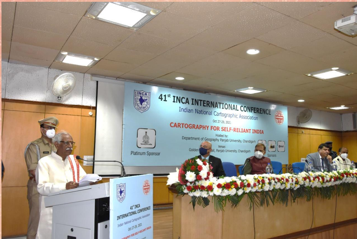
3 Day International Conference by Indian National Cartographic Association (INCA) hosted by Department of Geography, Panjab University, Chandigarh organized on the theme Cartography for Self Reliant India on 27.10.2021. The Chief Guest, Hon'ble Governor of Haryana, Shri Bandaru Dattatraya graced the event.