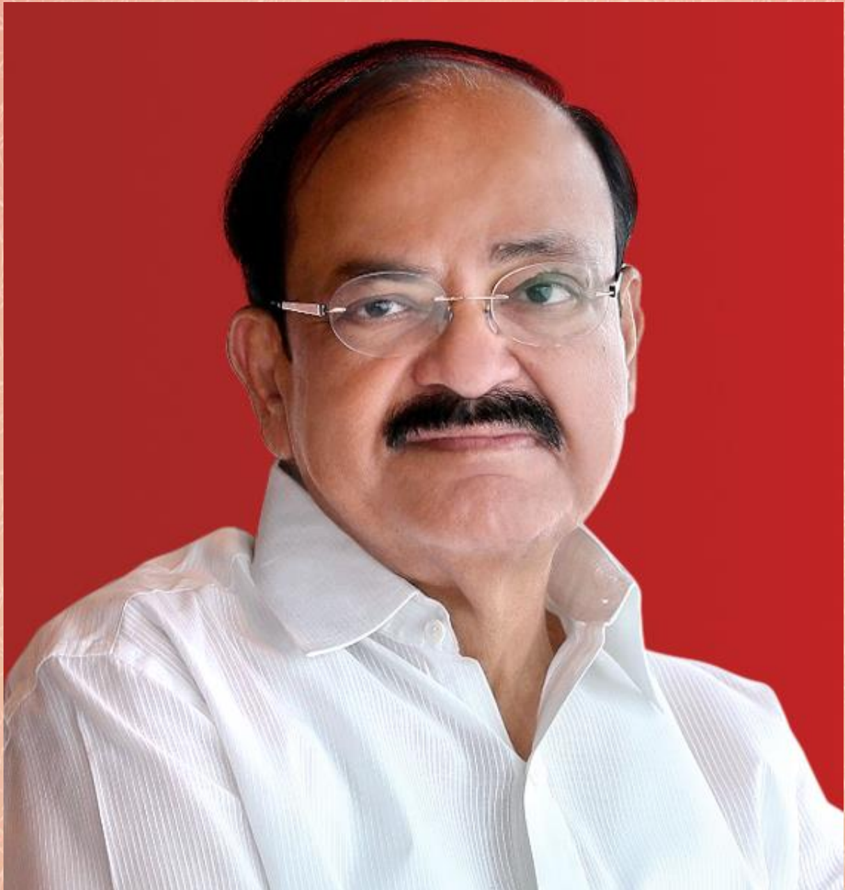
Hon'ble Shri M. Venkaiah Naidu, Vice President of India and Chancellor, Panjab University, Chandigarh