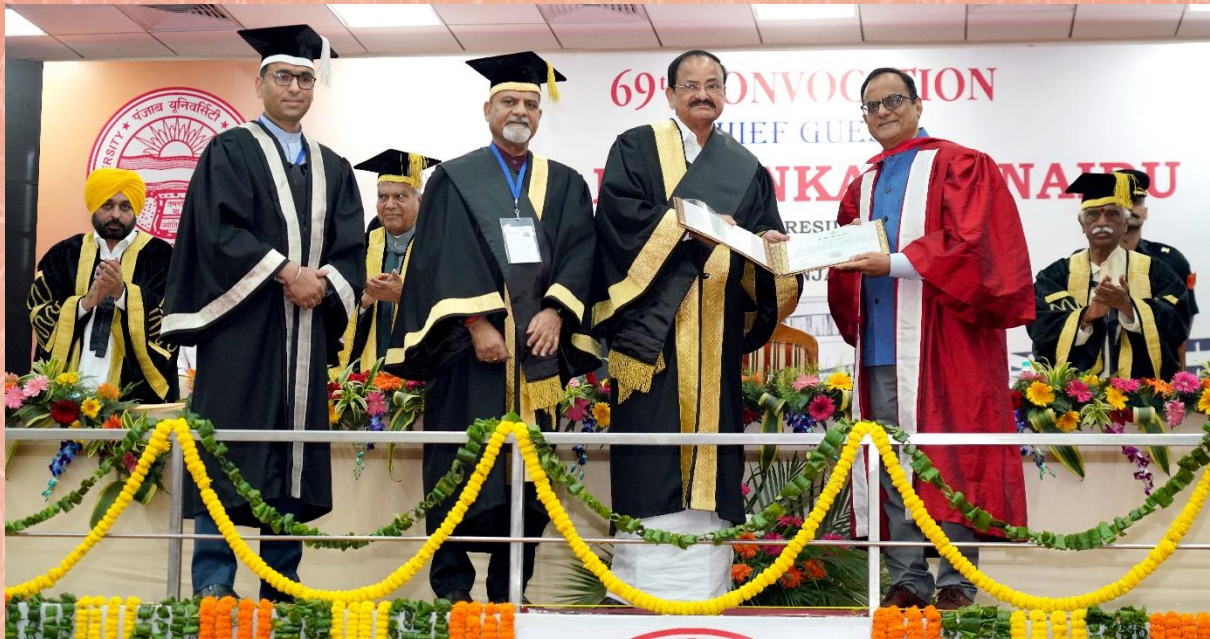
69th Annual Convocation of Panjab University, Chandigarh held on 6.5.2022 at Panjab University Campus. Hon'ble M.Venkaiah Naidu, the Vice President of India and Chancellor, Panjab University graced the occasion as Chief Guest. Sh. Banwarilal Purohit, Hon'ble Governor of Punjab, Sh. Bandaru Dattatreya, the Hon'ble Governor of Haryana, Sh. Bhagwant Mann, Chief Minister, Punjab, Sh. Manohar Lal Khattar, Chief Minister, Haryana, and Sh. Som Prakash, Union Minister of Commerce and Industry graced the occasion.