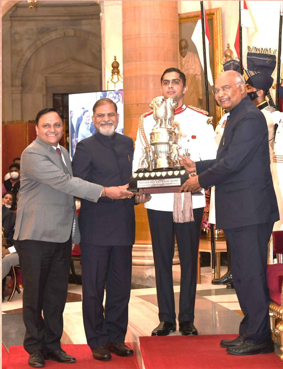
Panjab University, Chandigarh received Maulana Abul Kalam Azad(MAKA) Trophy for overall top performing University in Inter University Tournaments for 3rd Year in a row in the year 2020-21 from The Hon'ble President of India Sh. Ram Nath Kovind at a special function organized at the Darbar Hall of Rashtrapati Bhavan, New Delhi on 13.11.2021.