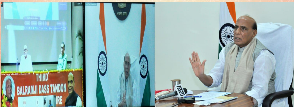
Defence Minister Rajnath Singh delivered lecture on National Security organized by Panjab University in memory of the Sh. Balramji Das Tandon founder member of Jan Sangh, former Deputy Chief Minister of Punjab and former Governor of Chhattisgarh on 30.8.2021.